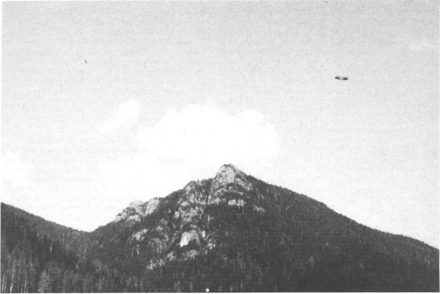
The Vancouver Island photograph